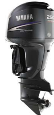
F250TXR / LF250TXR